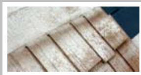
From left to right: composite roof shingles, a permanent wood foundation, and insulation made with shredded newspapers.

More than 1,000 people have already toured the house, including builders, wood association members, electricians, plumbers, trade school students, and consumers. The house is currently closed while research equipment is being installed but soon will be open again. For more information, visit the Center website at www.fpl.fs.fed.us/ahrc . ☞