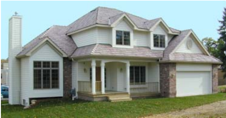
Research Demonstration House

LAST YEAR, more than 1.5 million single-family housing starts were recorded in the United States. Considering that 90 percent of America's housing is built from wood, using 20 billion board feet of lumber, proper management of this natural resource is essential.